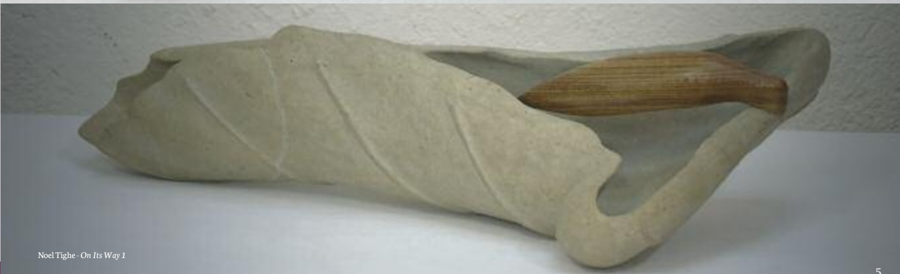
Noel Tighe - On Its Way 1