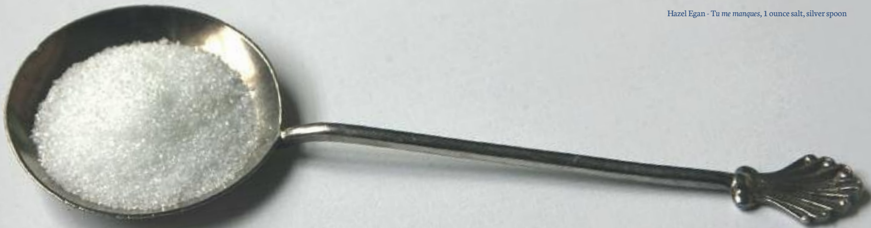
Hazel Egan - Tu me manques , 1 ounce salt, silver spoon

Entropy by Noel Tighe explores the great and constant pattern of birth, life and death in the ever-present, natural world. Noel sees these 3-dimensional drawings as a marriage of materials using the language of sculpture to analyse the relationship between the fusion of life and the passage of time.